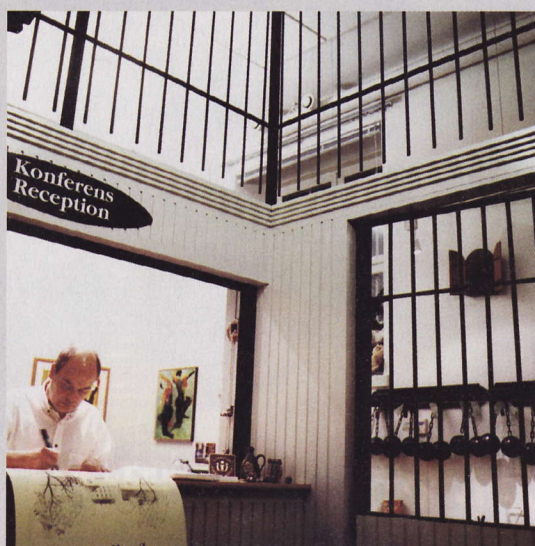
Cell time: The Langholmen retains vestiges from its prison days.