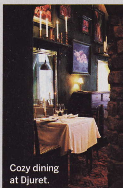
Cozy dining at Djuret.

Leading the city's green charge is the Scandic Hotel chain. Its sustainable programs began in the 1990s, and today all 18 properties in Stockholm have received the Nordic Swan Eco Label—the official certification awarded to products and services with a proven record of green initiatives. From low-energy lightbulbs to organic cuisine at all their locations, hotels displaying “the Swan” label have been vetted to meet certain environmental, health, and quality criteria. Rising next to Humlegården Park, the contemporary Scandic Anglans Hotel ( www.scandichotels.com ; from $206) features IKEA-style monochrome interiors. For warmer decor, opt for the Scandic Continental ( www.scandichotels.com ; from $116) just a block away